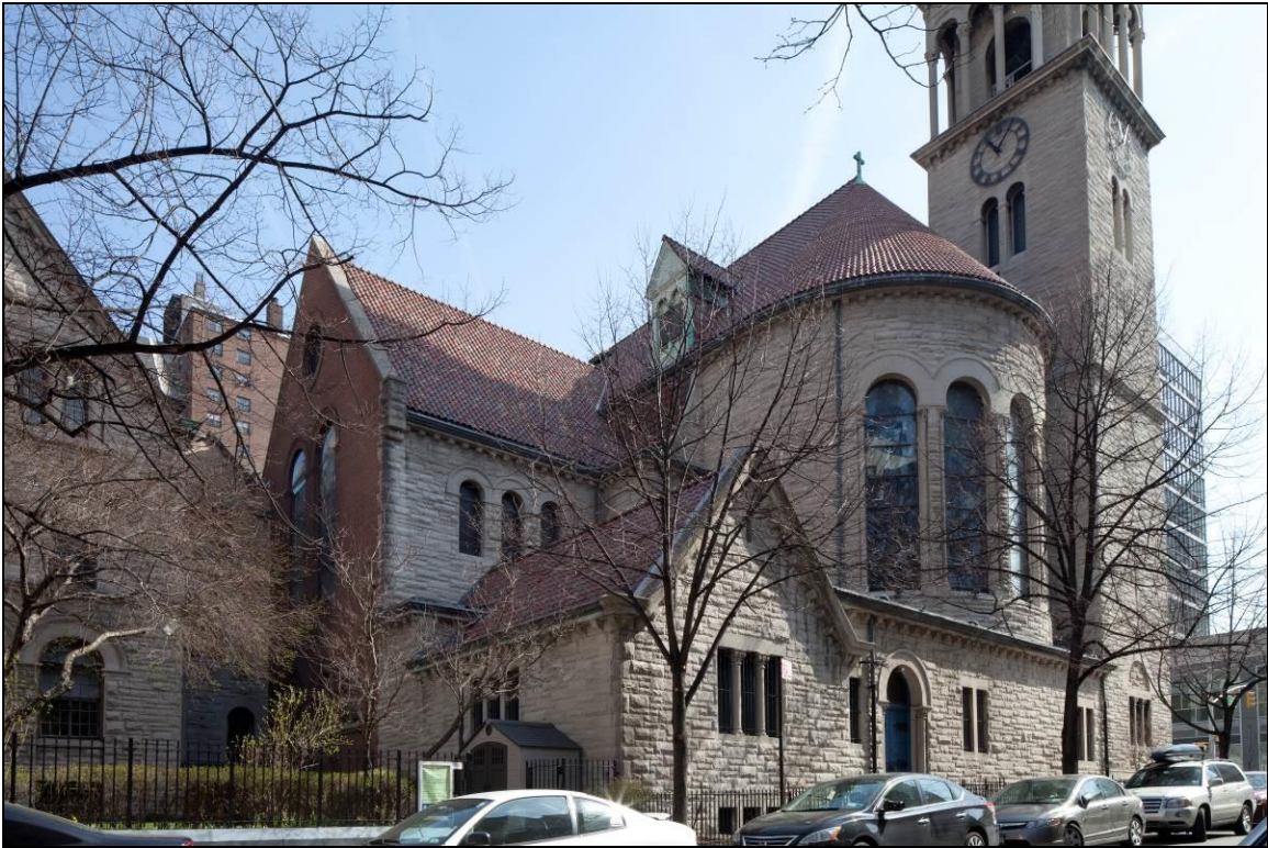
St. Michael's Church, south and west elevations