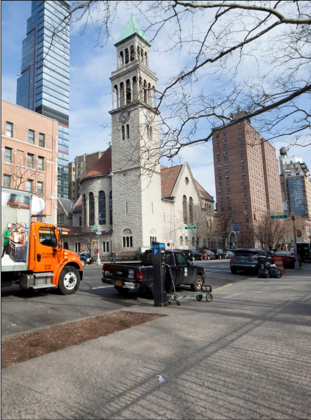
St. Michael's Church 201 West 99 th Street (aka 800-812 Amsterdam Avenue) Block 1871, Lot 29