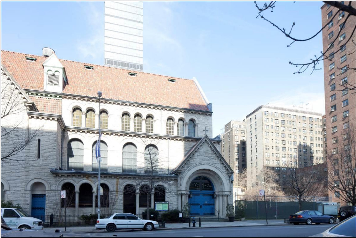
St. Michael's Church, east elevation