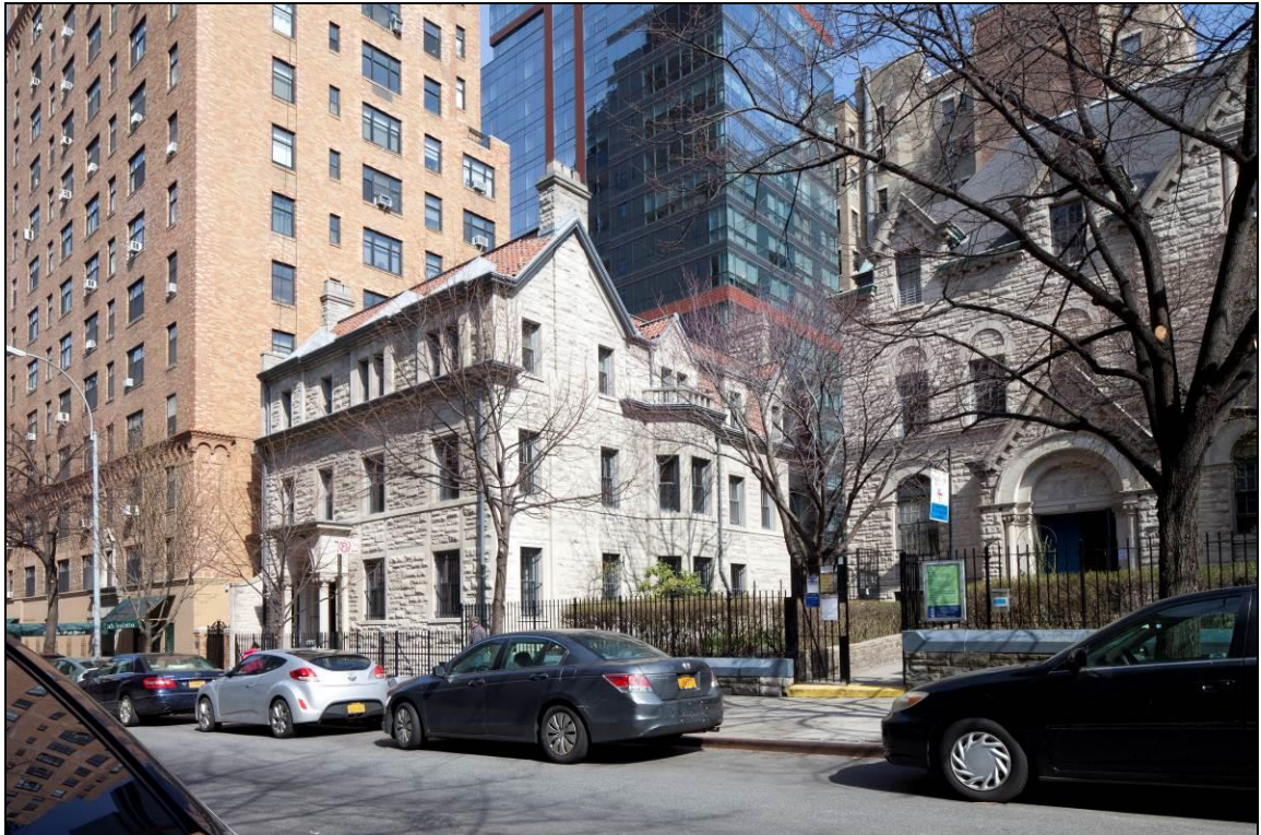
St. Michael's Rectory 227 West 99 th Street, Block 1871 Lot 24