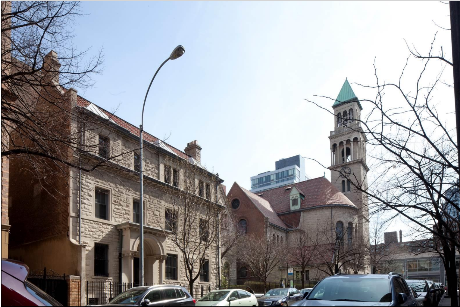
St. Michael's Episcopal Church Complex