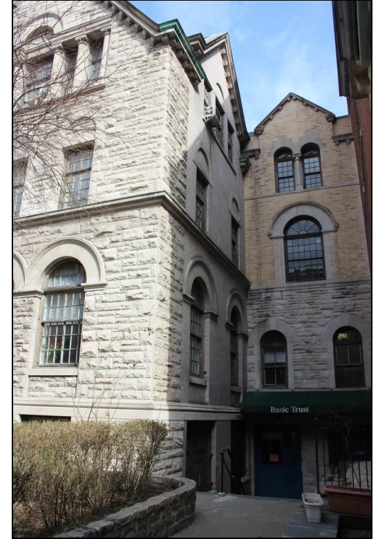
St. Michael's Parish House 225 West 99 th Street, Block 1871 Lot 29