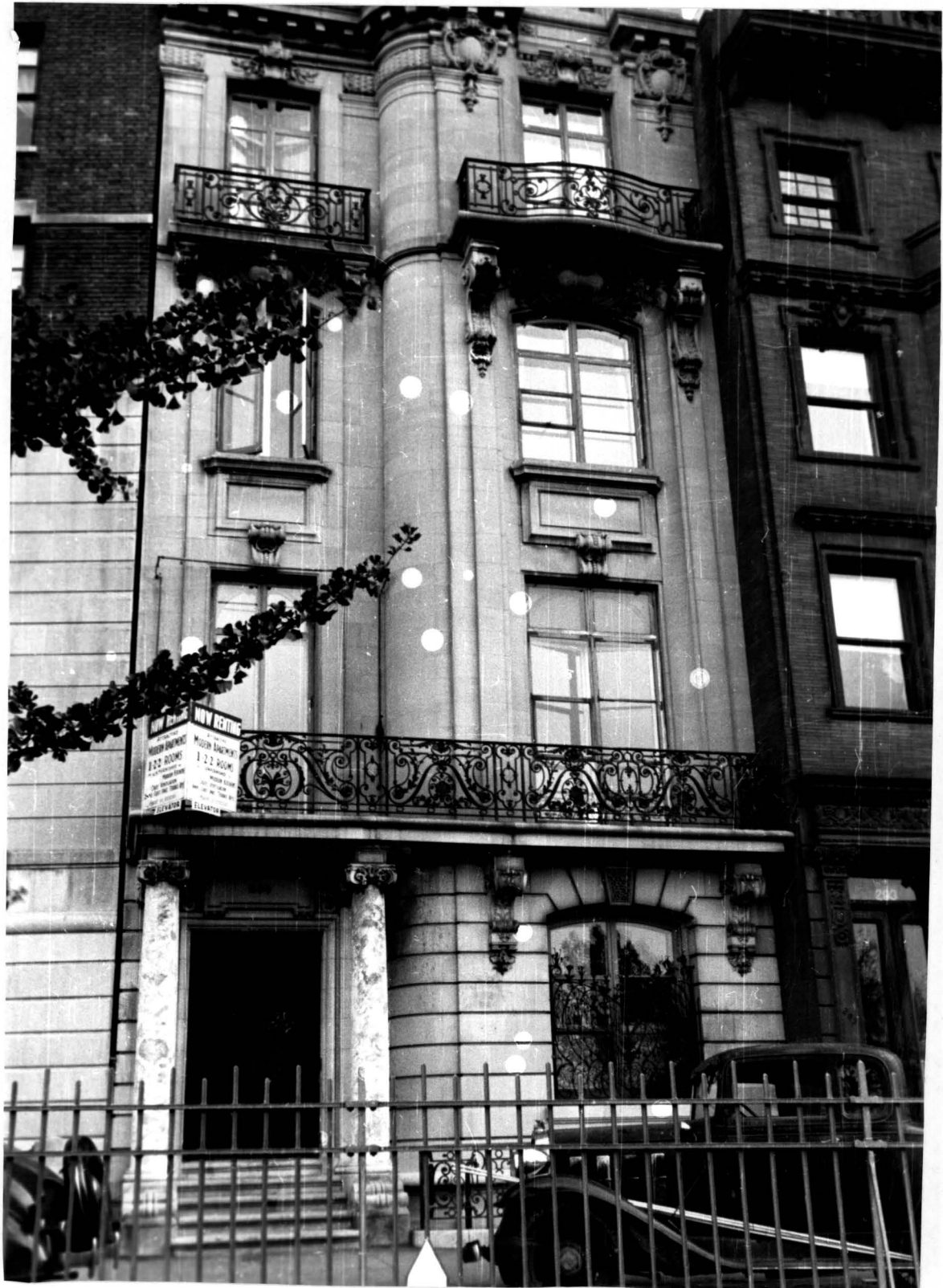
294 Riverside Drive House (William Baumgarten Residence) Historic Photograph, c. 1940