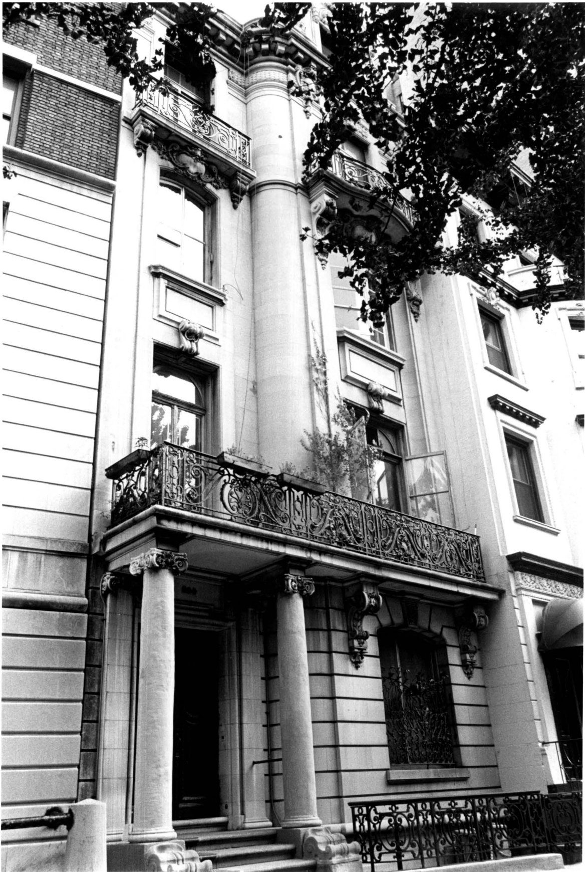
294 Riverside Drive House, 1900-01 (William Baumgarten Residence)