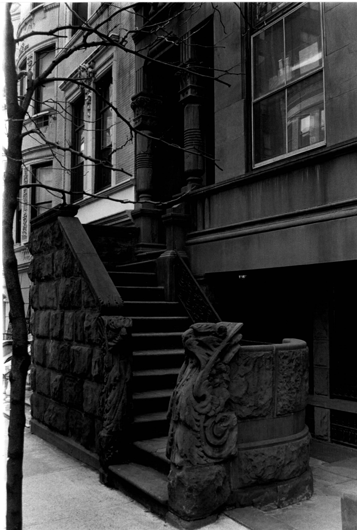
254 West 102nd Street House, Manhattan. Detail, stoop. 1892-93; Schneider & Herter, architects.