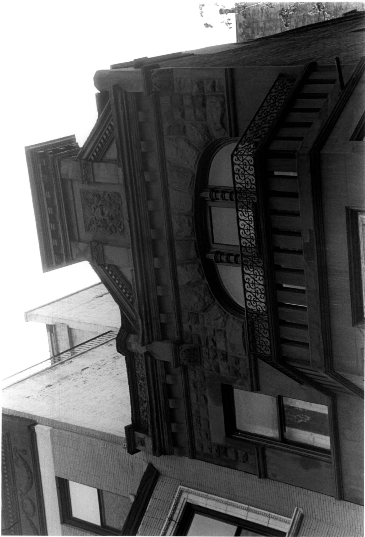
254 West 102nd Street House, Manhattan. Detail, upper story. 1892-93; Schneider & Herter, architects.