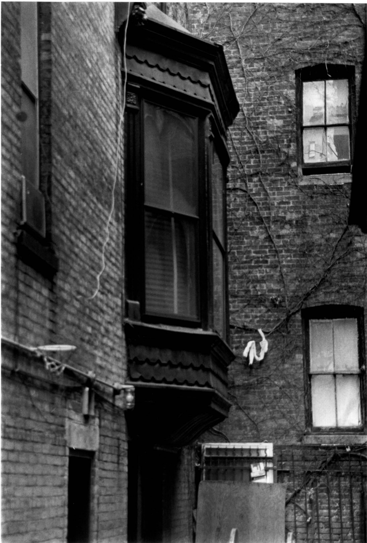
254 West 102nd Street House, Manhattan. Bay window in west facade. 1892-93; Schneider & Herter, architects.