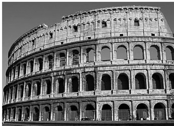
Roman Colosseum, 1st Century