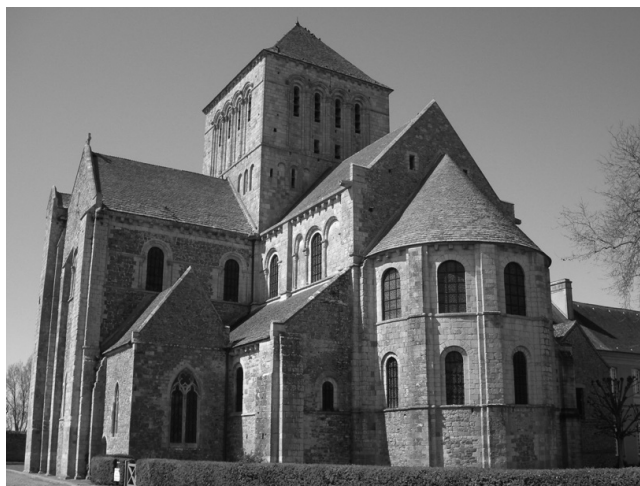
Lessay Abbey, c. 1100

American Museum of Natural History (West 77th Street), Vaux & Mold, 1872-77